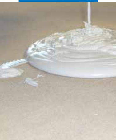
Mapefloor Decor 700 poured on the substrate immediately after mixing