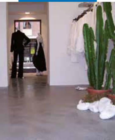
Floor made using Mapefloor Decor 700

All relevant references for the product are available upon request and from www.mapei.com