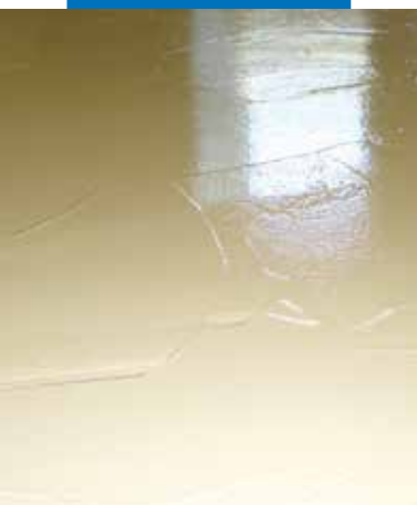
Fresh surface of Mapefloor Decor 700 after the application with a trowel