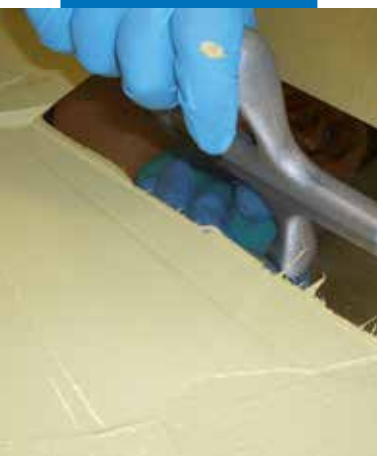
Application of the product with a straight trowel