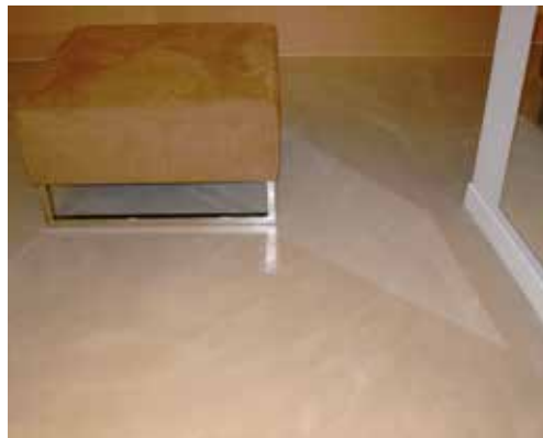
Floor made using Mapefloor Decor 700