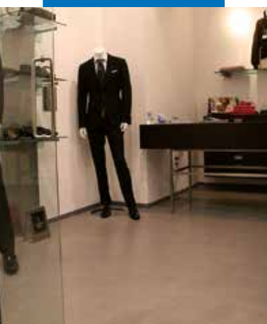
Floor made using Mapefloor Decor 700