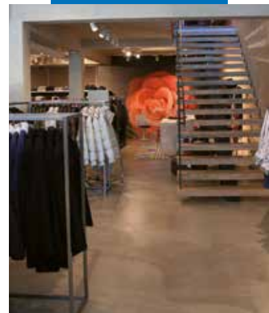
Floor made using Mapecolor Decor 700