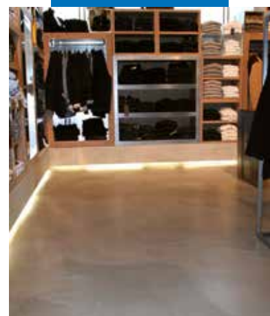
Floor made using Mapecolor Decor 700